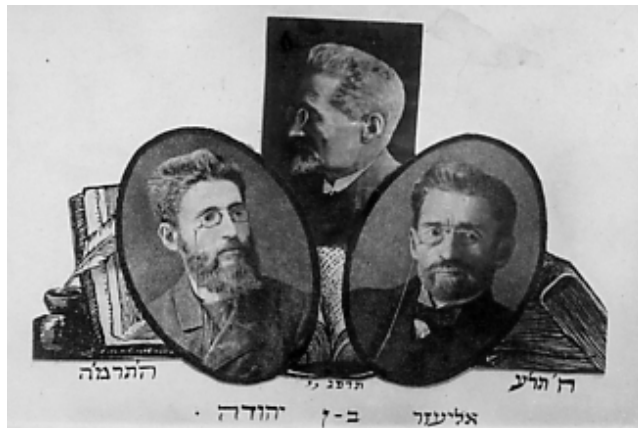
Eliezer Ben-Yehuda: 1885, 1910, and 1922