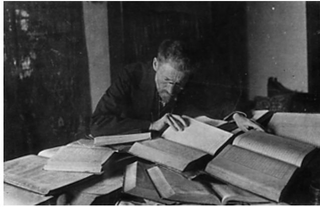
Eliezer Ben-Yehuda in his study