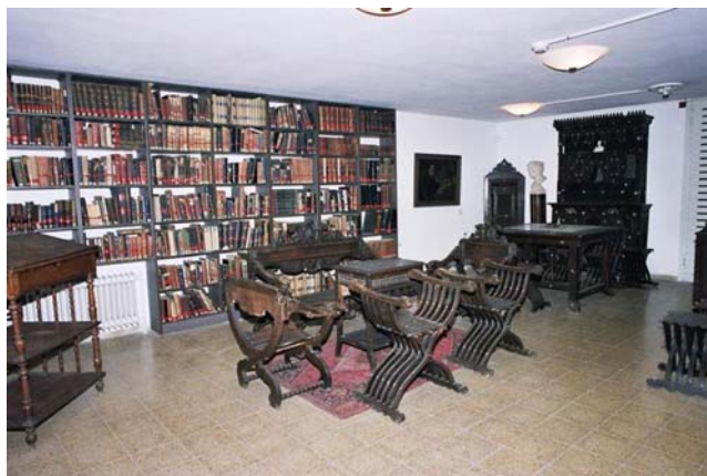
The Ben-Yehuda Room at the Academy of the Hebrew Language