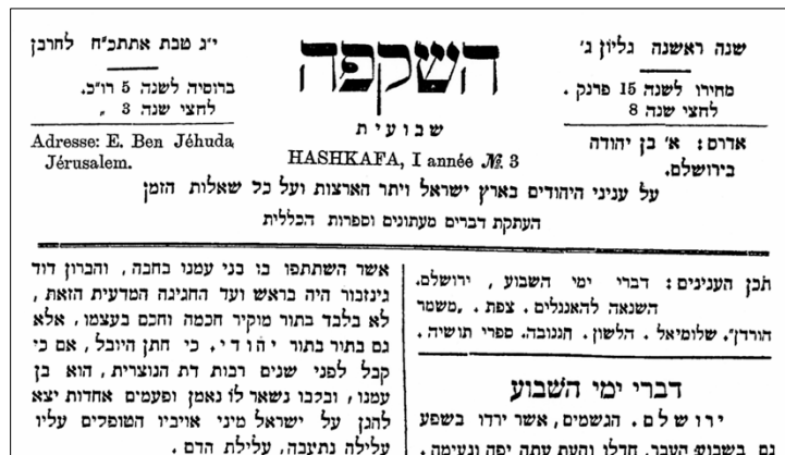
Hashkafa : Newspaper edited by Ben-Yehuda (1896–1908)