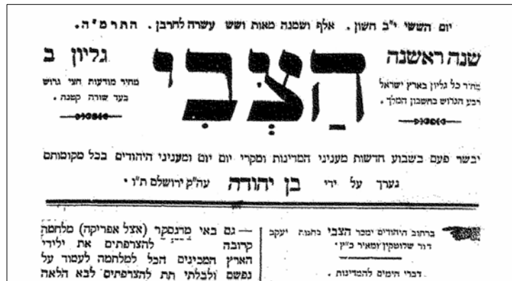
Hazewi : Newspaper edited by Ben-Yehuda (1884–1901; 1908–1914)